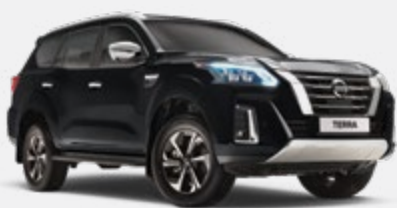
Black - G42