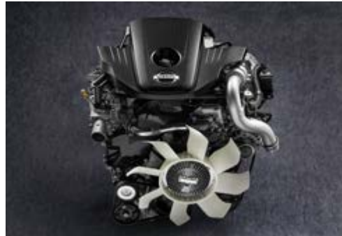
2.5ℓ DDTI INTERCOOLED TURBO DIESEL ENGINE

Whether it's rush hour traffic or pouring rain, count on the muscle, efficiency and safety you need to get you through it comfortably.