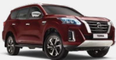
Dark Red - NAW