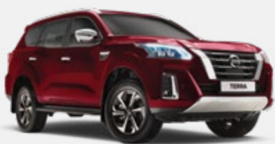
Red S - AX6