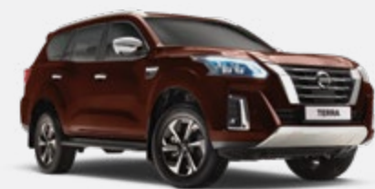
Brown - CAU