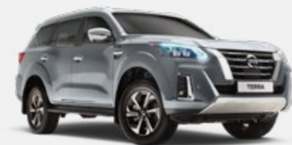
Silver - K23