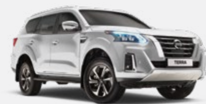
White P - QX1