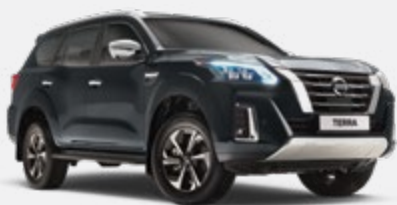
Grey - K21